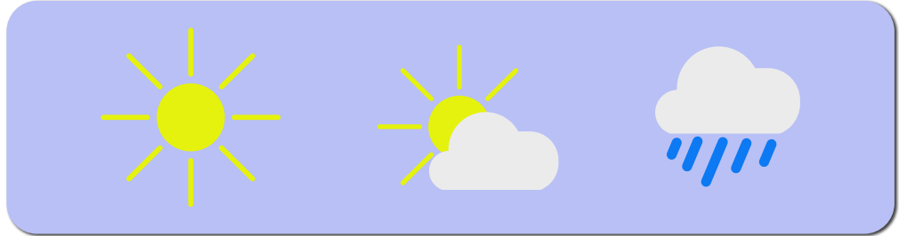
TODAY'S WEATHER (CIRCLE ONE)